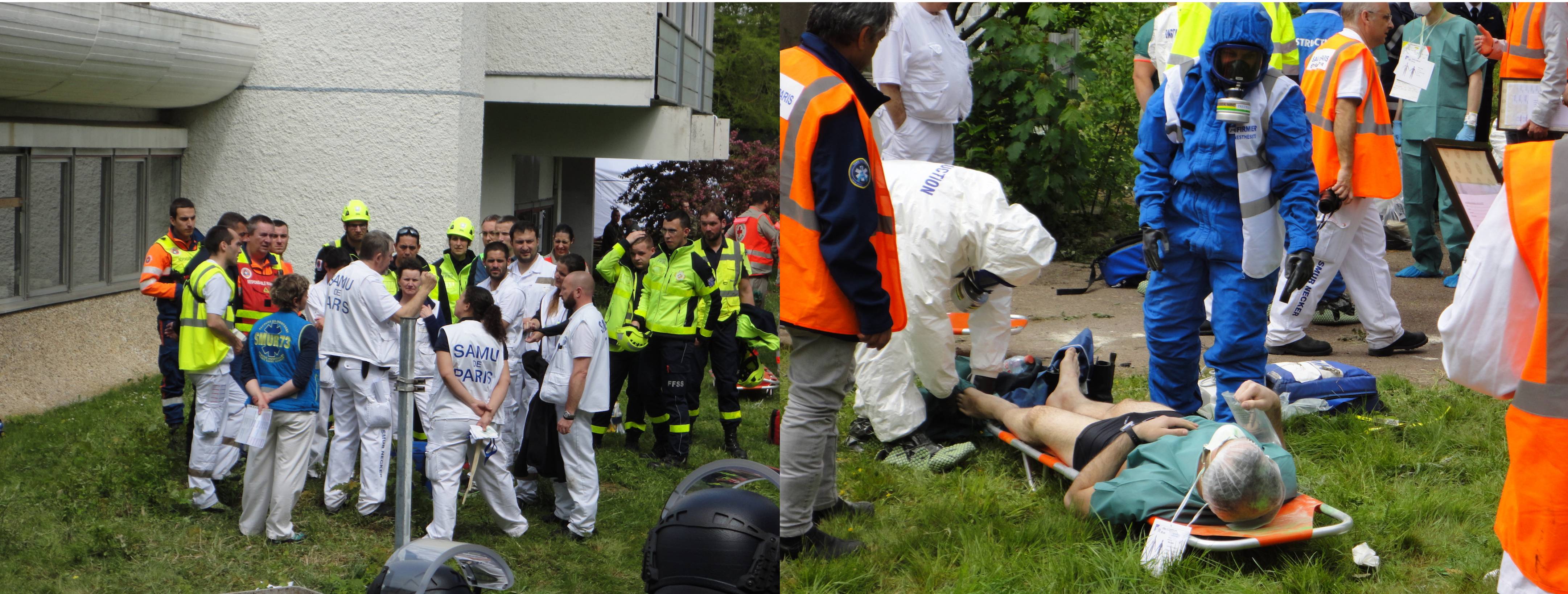
Figure 4: Practice for Terrorism.