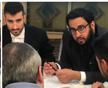
2019 EQuIP attendees participate in workshops