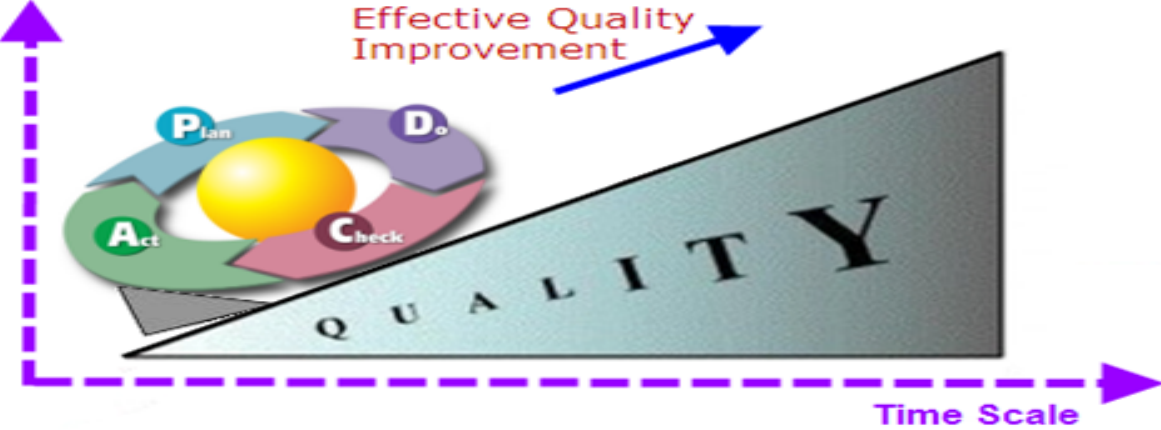
Figure 1: The Deming wheel for a continuous improvement of quality and safety of the care.